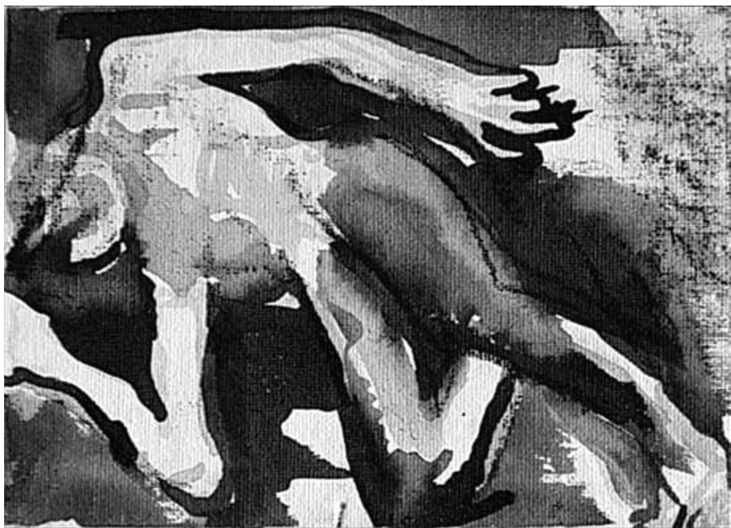
Nightmare Series, studies, Drawings: Ink and organic stains on canvas board,,2009, Top: untitled 2 & 10 (left page), untitled 6 & 3