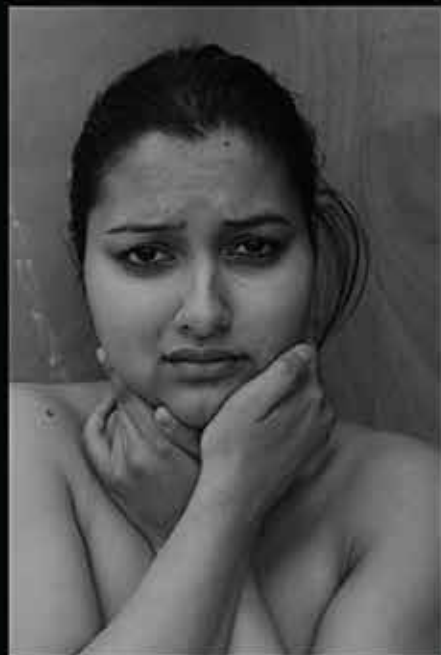
Animated film stills, Seven Sins Series, 2012