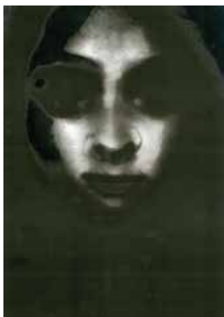
Transgenerational 1-9, The Gap between Grandmother, Mother and I, Photography, 12x18 in, 2016