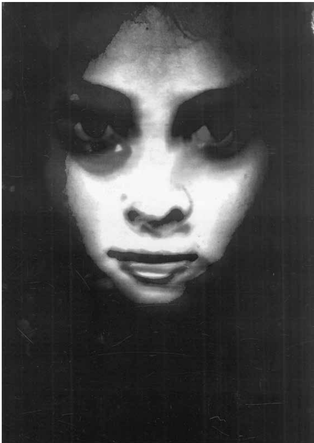
Transgenerational 6, The Gap between Grandmother, Mother and I, Photography, 12x18 in, 2016