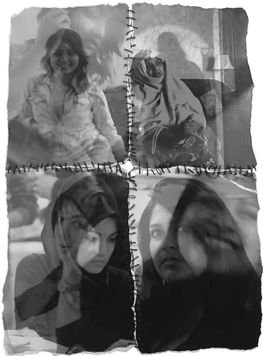
New and Old, Journal documentation, Photograph and mixed materials, 8.5x11 in, 2010